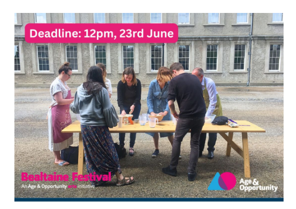
Call for participants for Citizen Curator Panel for Bealtaine Festival 2026

Currently seeking individuals aged 50+ to join a pilot Citizen Curator Panel for Bealtaine Festival 2026. This voluntary group will help shape one event in the 2026 Bealtaine Festival by offering ideas and input on its programming. Panel members will meet in June/July and possibly again in September 2025 to collaborate, brainstorm, and learn. All work will be guided by the Festival Curators and Director, and participants will have the opportunity to gain hands-on experience in arts programming.