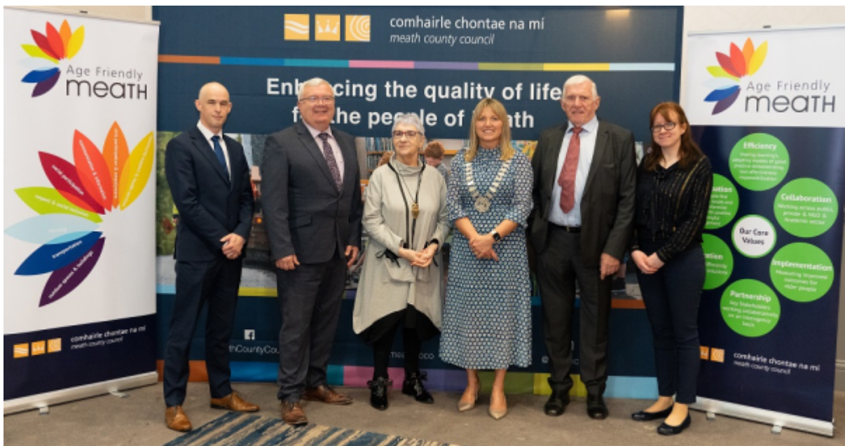
'Meath Cares About Older People'