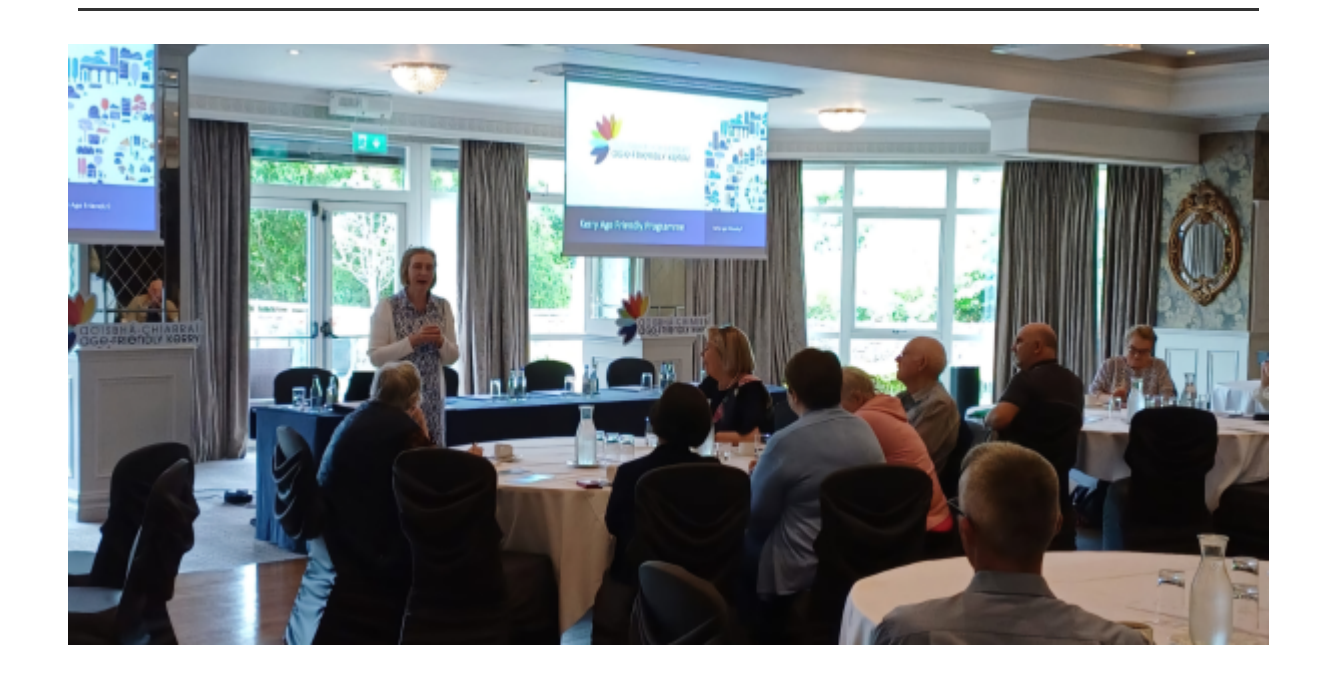
Kerry Older People's Council AGM