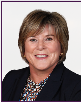
Mary Butler TD Minister of State at the Department of Health

Mary Butler is Minister of State at the Department of Health with special responsibility for Mental Health and Older People. She is a TD representing the Waterford Constituency. In the 32nd Dáil, Mary served as Chairperson of the Joint Oireachtas Committee for Business, Enterprise & Innovation and the All Party Oireachtas Group on Dementia.