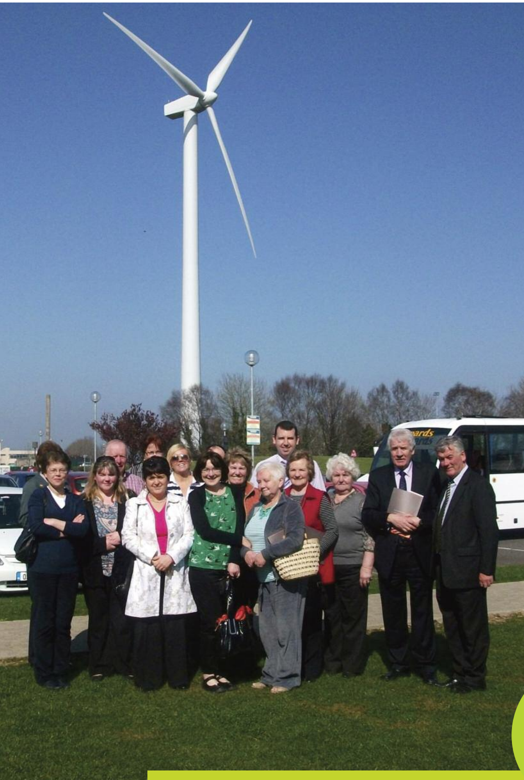
Members of Monaghan's SPC and Older People's Forum receive an unforgettable tour of the age-friendly projects rolling out in County Louth. Visit kindly hosted by our friends and colleagues in the Netwell Centre at DkIT.