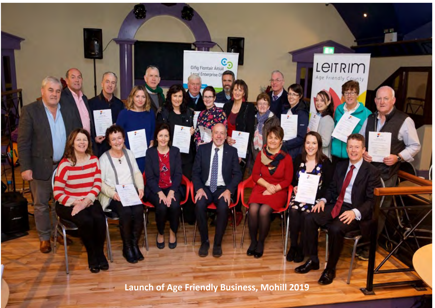
Launch of Age Friendly Business, Mohill 2019