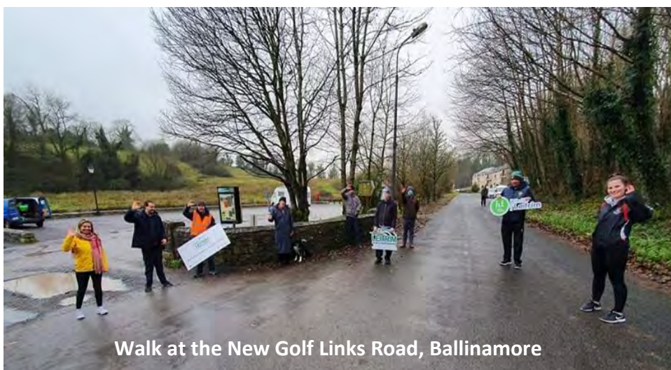
Walk at the New Golf Links Road, Ballinamore

As a result, several programs have been run specifically for older people who wish to remain fit and active.