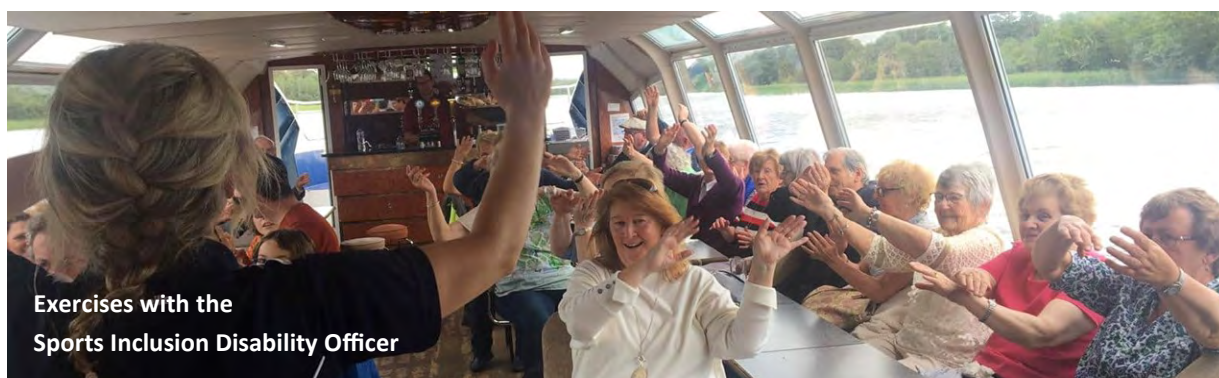
Exercises with the Sports Inclusion Disability Officer