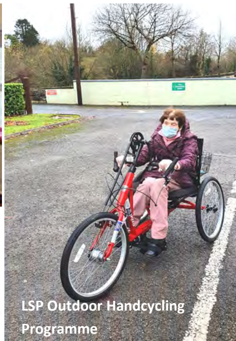
LSP Outdoor Handcycling Programme

Earlier this year Healthy Leitrim in conjunction with Leitrim Sports Partnership supported Strength and flexibility capacity building classes across Leitrim. The classes were a huge success and will continue again in 2021. Programme funded by Healthy Ireland supported by the DCYA. #healthyleitrim #dcya #leitrimspartnership #keepwell #keepactive #Leitrim PPN