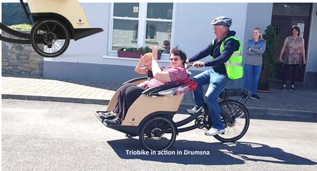
Triobike in action in Drumsna