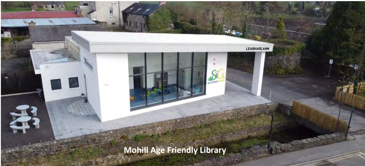
Mohill Age Friendly Library

A new age friendly space An Seomra Cairdis has been developed at Mohill Library with age friendly seating, tea/coffee making facilities.