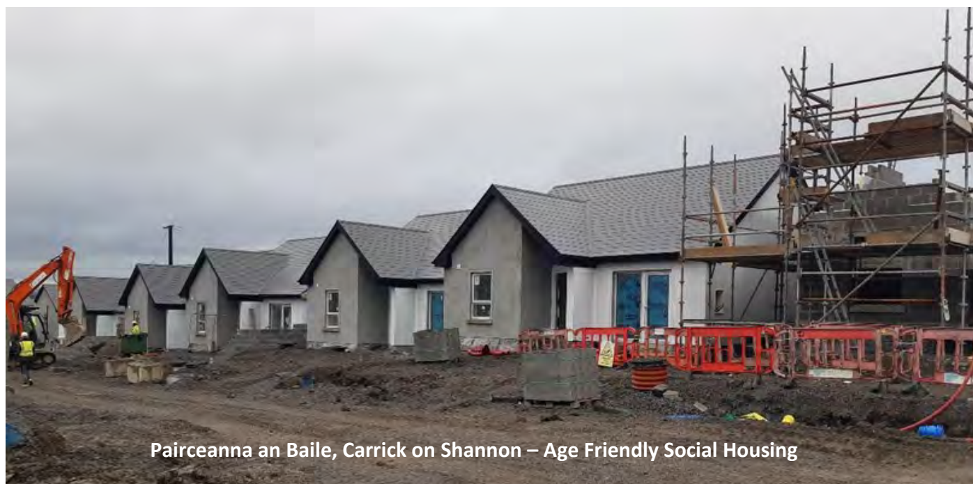
Pairceanna an Baile, Carrick on Shannon – Age Friendly Social Housing

The Age Friendly Housing Technical Specialist has engaged with Leitrim County Council Planning Section to ensure that the next Leitrim County Development Plan encompasses the commitments set out in Housing Options for our Ageing Population, using the Age Friendly Principles and Guidelines for the Planning Authority Document prepared to assist planners charged with undertaking preparation of a development plan to include Age Friendly objectives.