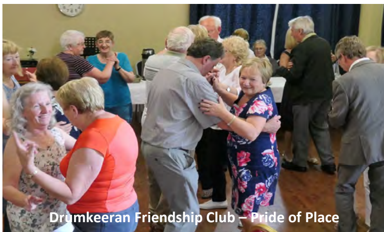
Drumkeeran Friendship Club – Pride of Place

Drumkeeran Friendship Club represented Leitrim in Pride of Place 2019 – a prestigious 32 county competition.