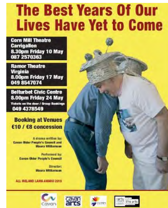
The Award Wining OPC Drama Production 'The Best Years of Our Life Have Yet to Come'