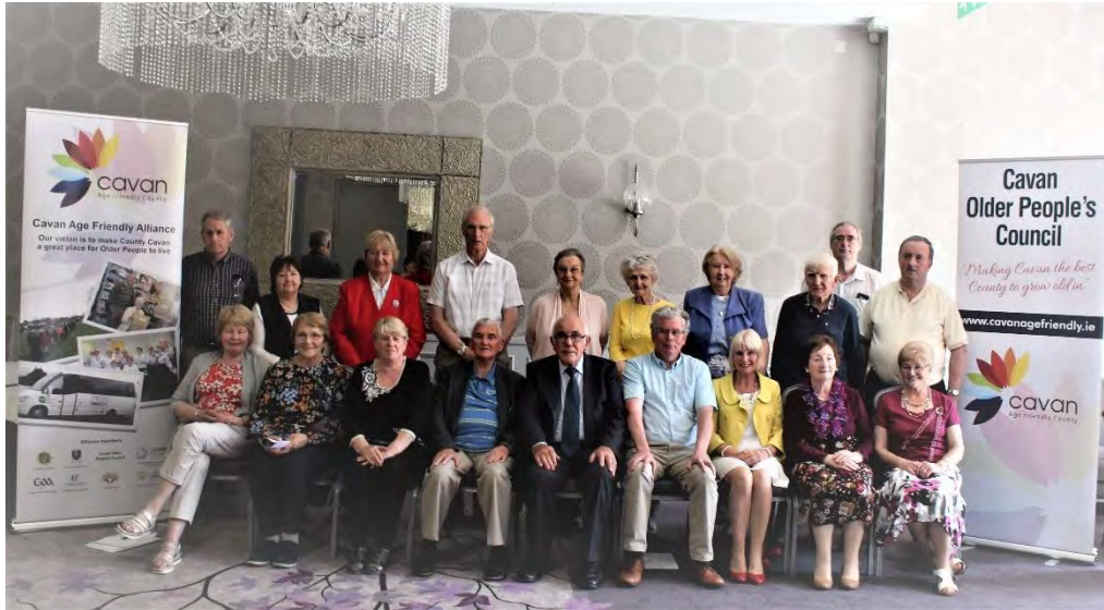
Newly elected Cavan Older People's Council Executive at the AGM in June 2019. The committee retained many existing members and welcomed some new members