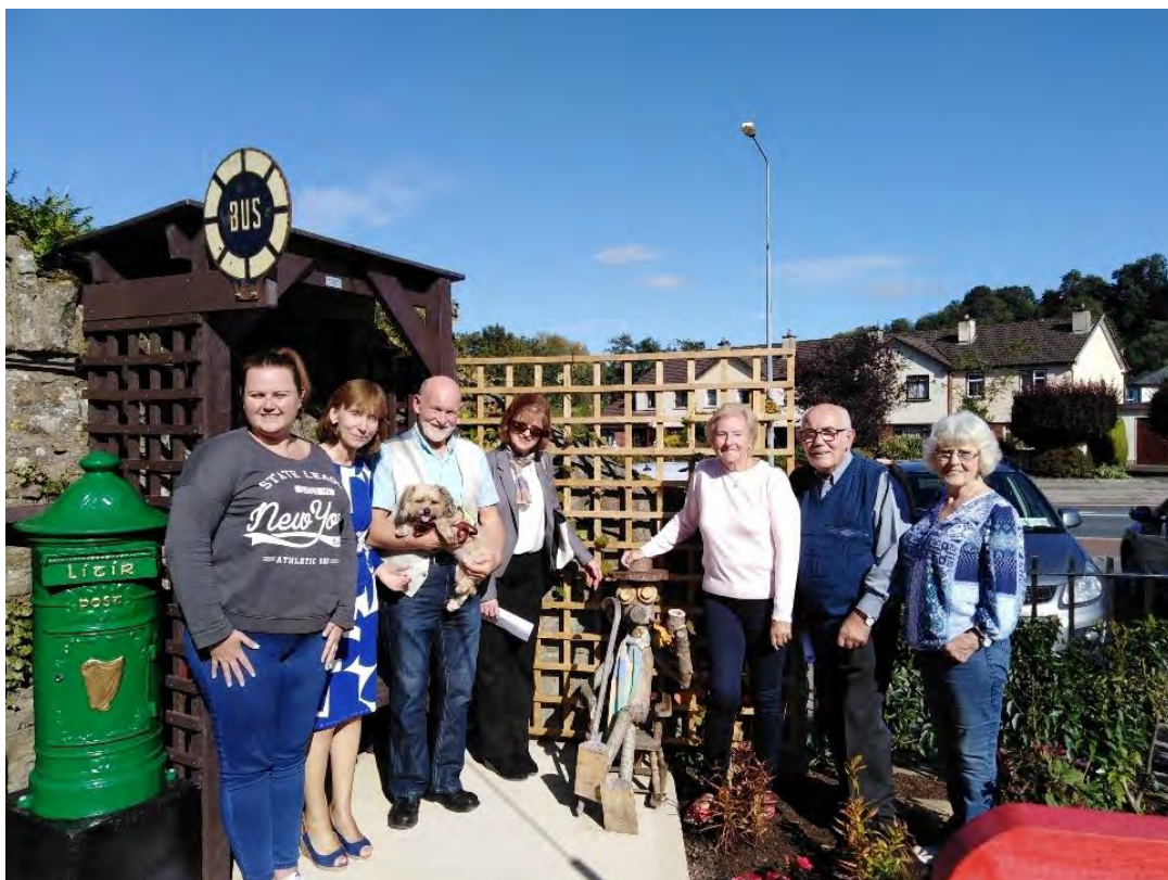
Cavan Dementia Friendly Garden won an award at the National Age Friendly Recognition & Awards Ceremony in 2019 for their Dementia Friendly Garden.