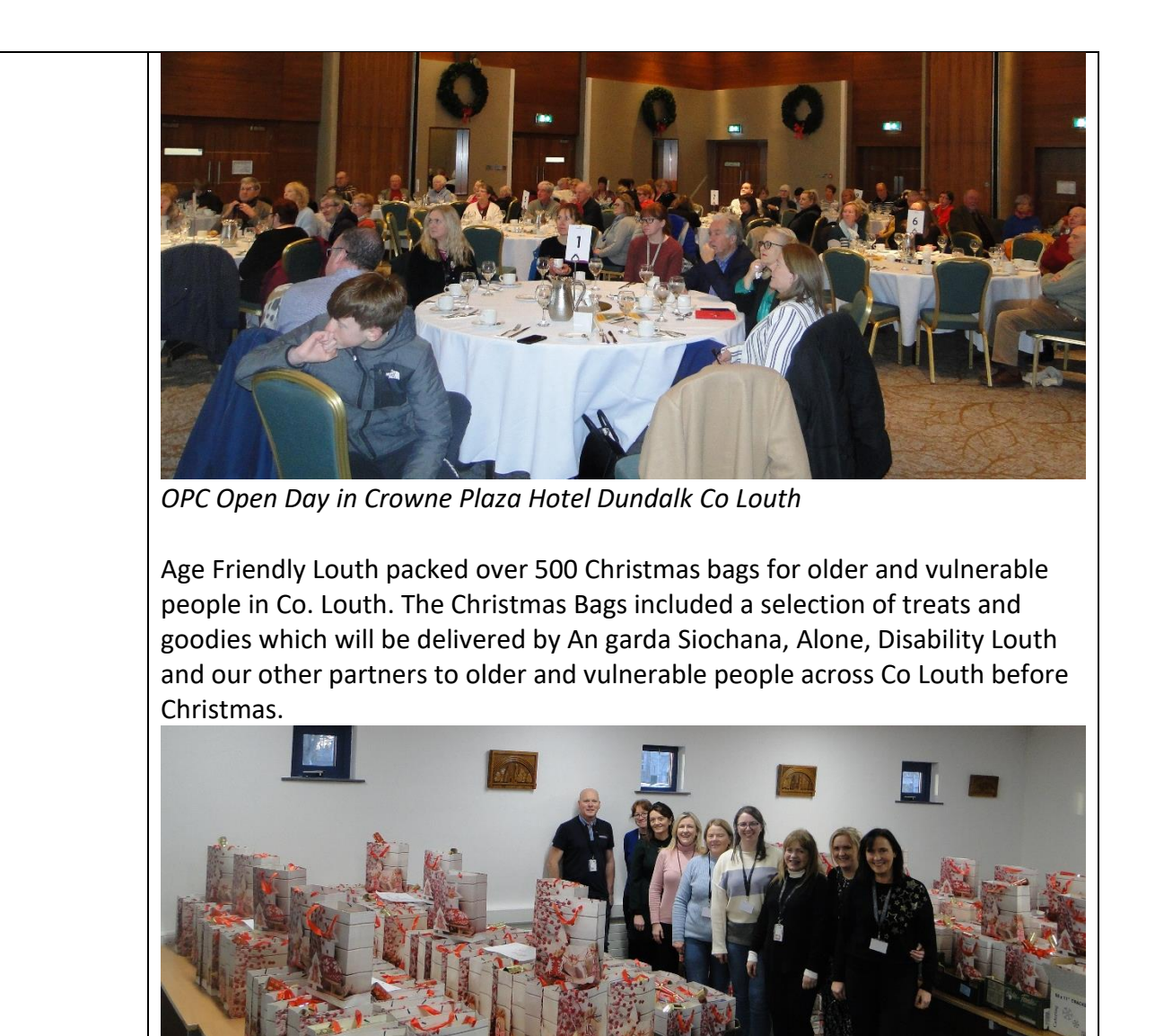
Age Friendly Team & Community Team in Louth County Council who took part in Christmas Bag pack.