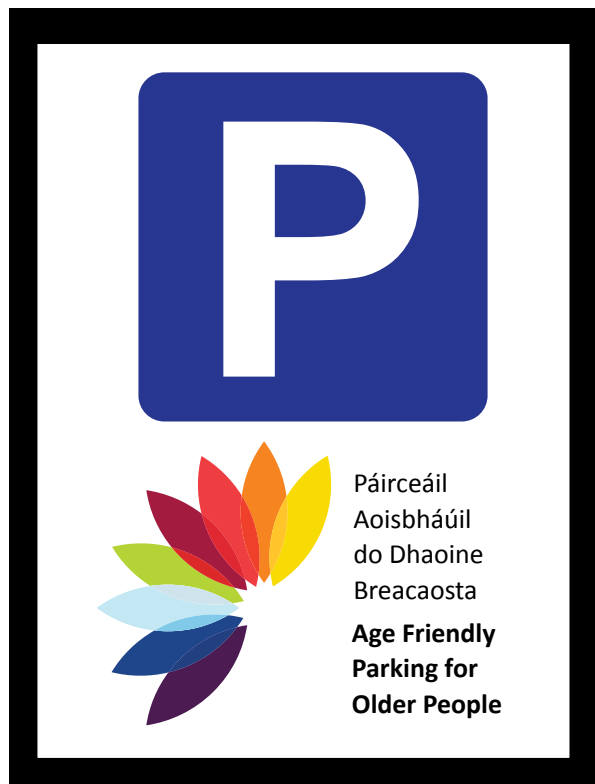
Age Friendly Sign 450mm X 600mm