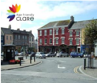
Universal Design Walkability Audit Report Kilrush, County Clare | 2020